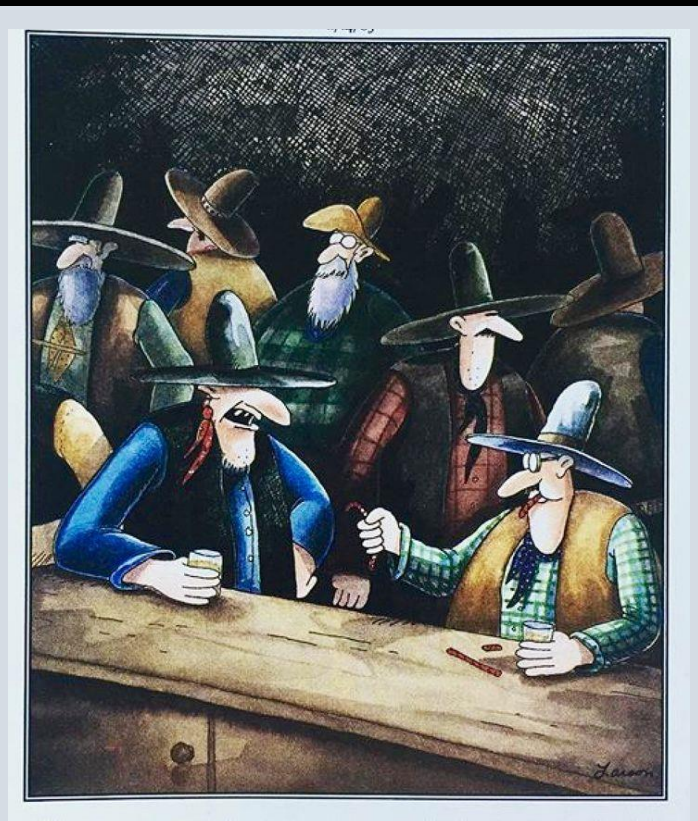
"Saaaaaay, aren't you a stranger in these parts? Well, I don't take candy from strangers ."